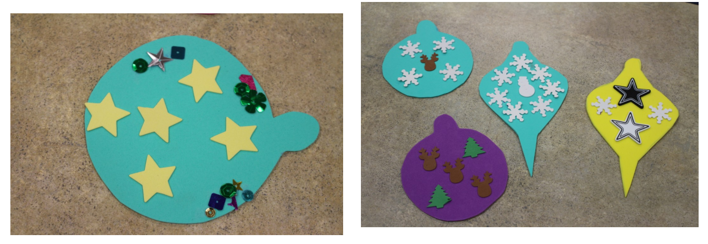
Some of the results - aren't we a talented bunch?!