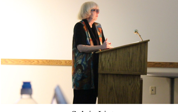
The group seems to be enjoying the program.