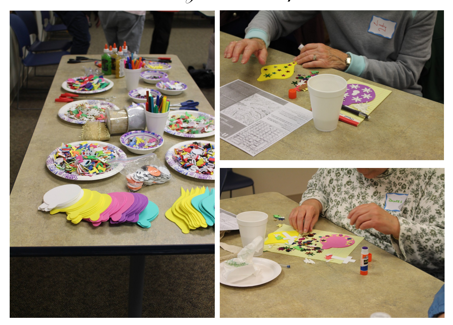
Blank ornaments and decorations to choose from.